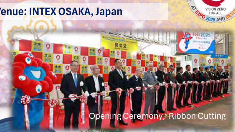
Opening Ceremony, Ribbon Cutting

Come and join the Future Monodzukuri International EXPO and Well-being Tech Forum!