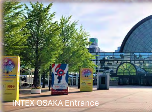
INTEX OSAKA Entrance