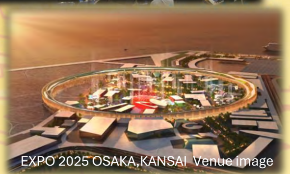
EXPO 2025 OSAKA, KANSAI Venue image